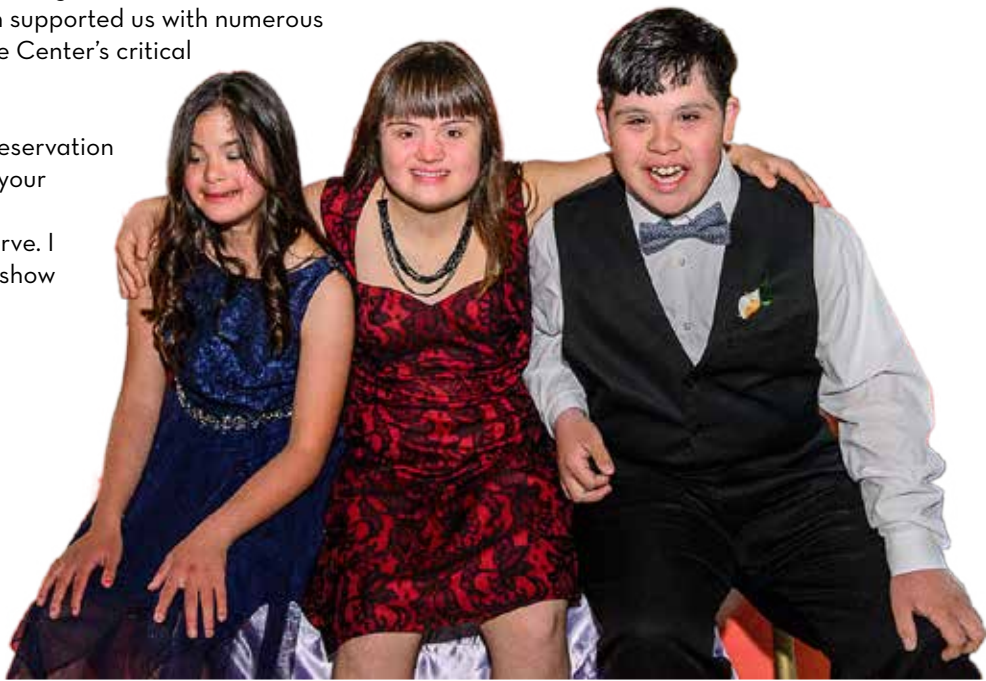
David Dubinsky CEO